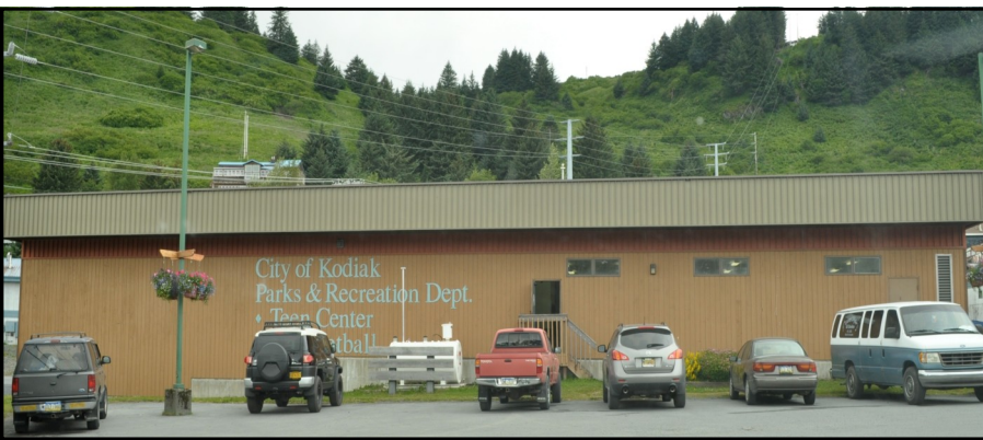
Precinct #32/825—Kodiak No. 2—Teen Center

Anyone who lives in this area (Teen Center side of Mill Bay Road) should vote at the Teen Center located at 410 Cedar Street.